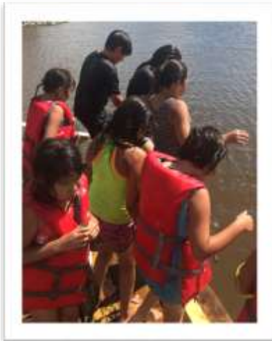
Swim to Survive Program

The Lifesaving Society is a national charity working to prevent drowning and water-related injuries. Lifesaving training programs, Water Smart public education, water incident research, safety management services and lifesaving sport are just some of the ways we save lives and prevent personal injury.