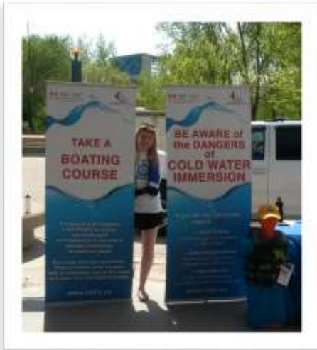
Safe Boating Week 2016 Launch