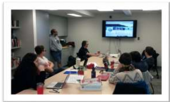
National Lifeguard Instructor Course - Winnipeg