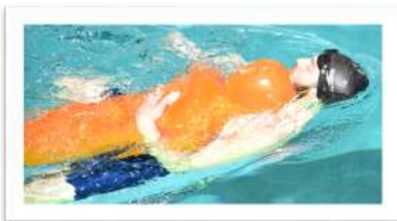
2016 Manitoba Lifeguard Championships