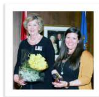
Her Honour & Our President

"Whom So Ever You See In Distress - Recognize In Them A Fellow Man"