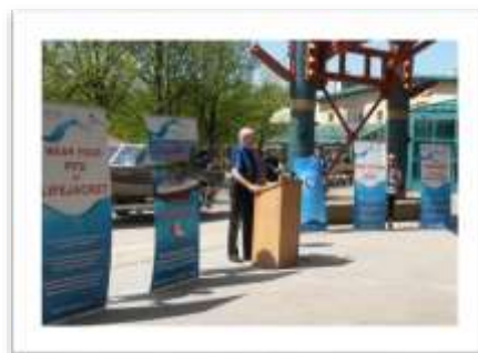
Safe Boating Week 2016 Launch

The year closed out with preparation for 2017 well underway. It looks to be as busy and promising a year as 2016 did at the start.