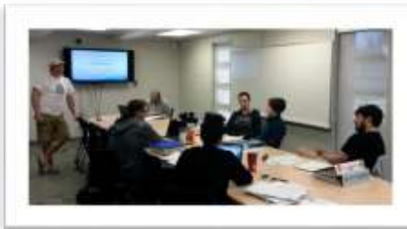
National Lifeguard Instructor Course - April 2016

In the fall of 2016, all National Lifeguard instructors / examiners and all Instructor Trainers attended recertification clinics. These are always energetic, exciting clinics with lots of idea sharing, problem solving, networking and professional development happening. It is always a great experience when we run these clinics.