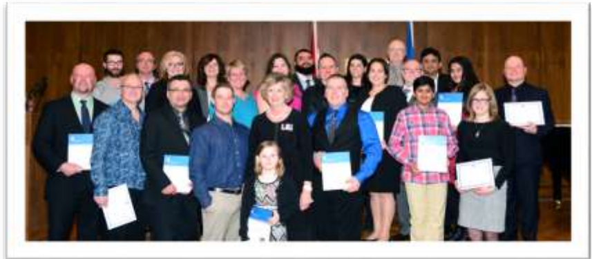
2016 Rescue & Honour Awards—Government House 2017