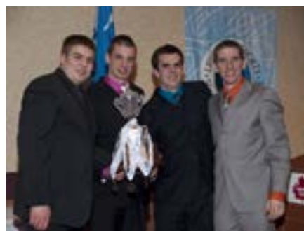
2010 Manitoba Lifeguard Championship First Place Team: Thunderbay - Still Contains Nuts