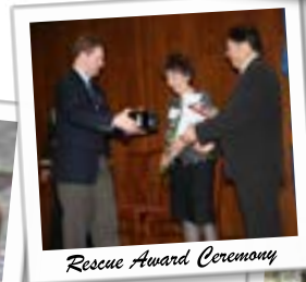
Rescue Award Ceremony