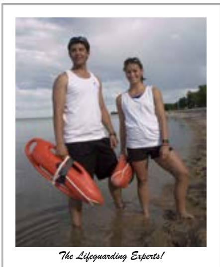
The Lifeguarding Experts!