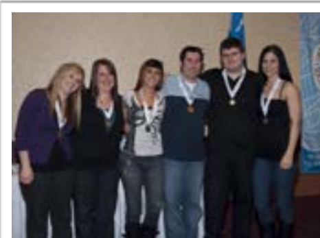
2010 Manitoba Lifeguard Championship Manitoba First Place Team: 17 Wing - The Forces