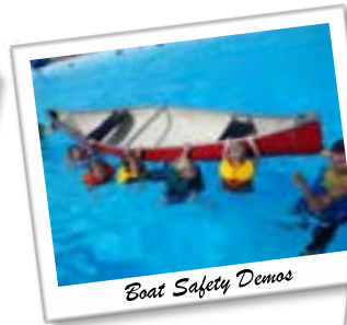
Boat Safety Demos