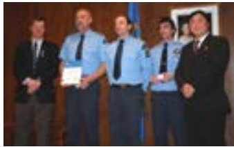
C.C.G.C. Vakta Crew "A"